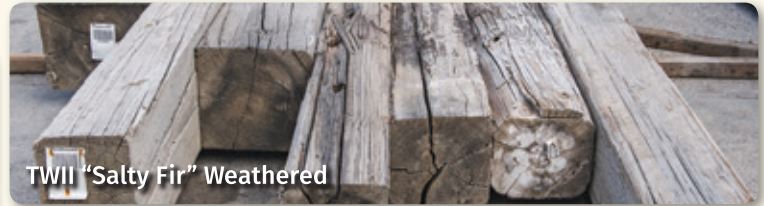
TWII "Salty Fir" Weathered