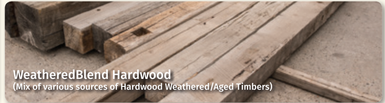
WeatheredBlend Hardwood (Mix of various sources of Hardwood Weathered/Aged Timbers)