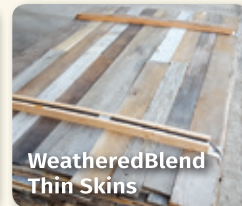
WeatheredBlend Thin Skins