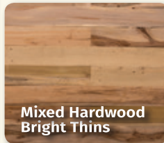
Mixed Hardwood Bright Thins