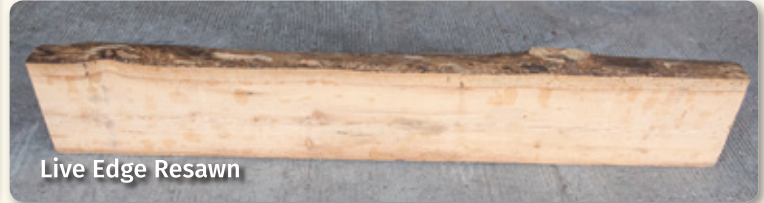
Live Edge Resawn