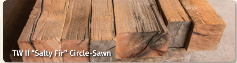
TW II "Salty Fir" Circle-Sawn