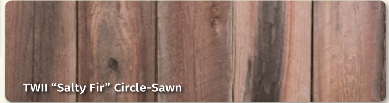
TWII "Salty Fir" Circle-Sawn