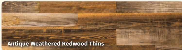
Antique Weathered Redwood Thins