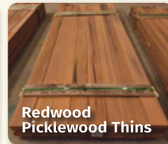
Redwood Picklewood Thins