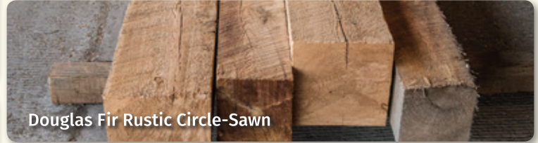
Douglas Fir Rustic Circle-Sawn