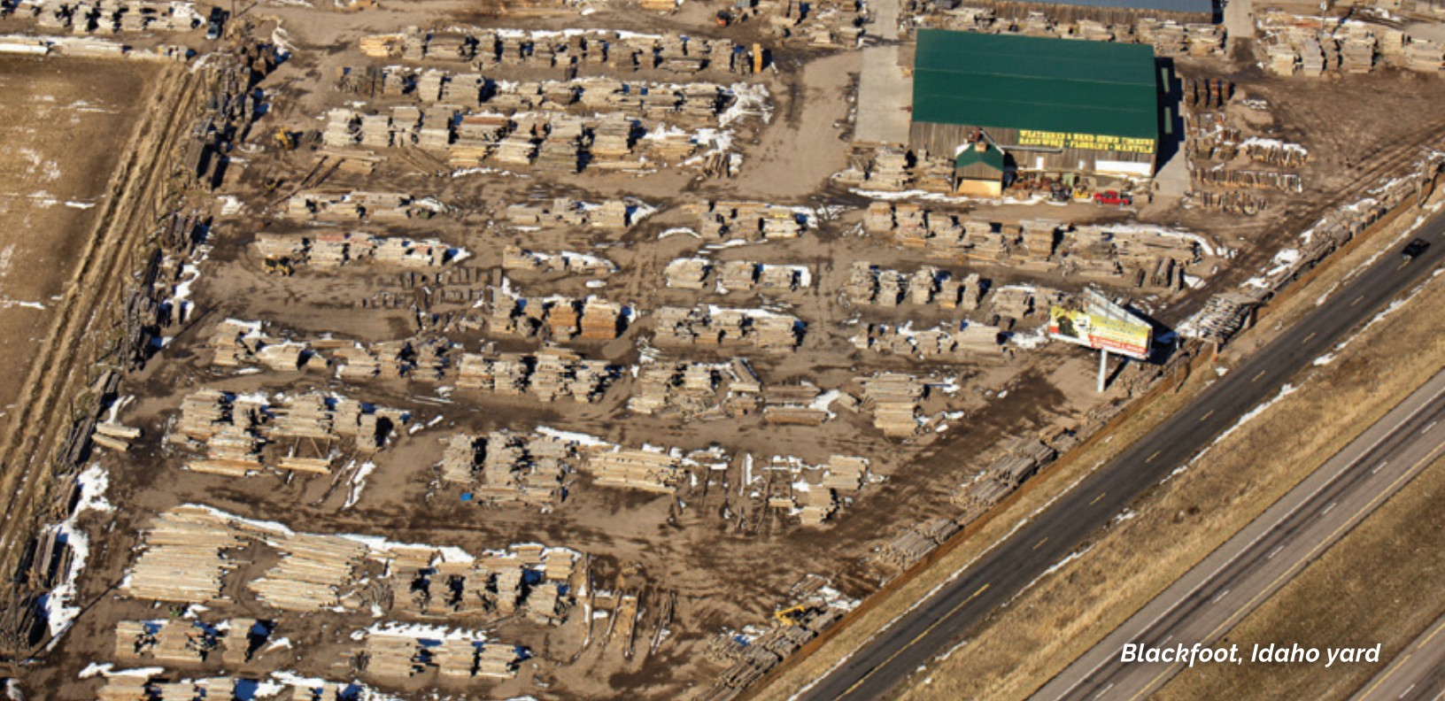
Blackfoot, Idaho yard